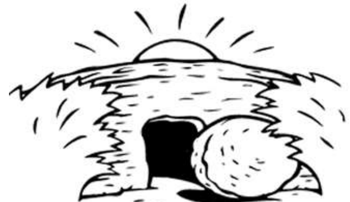
"He has risen! He is not here." Mark 16:6