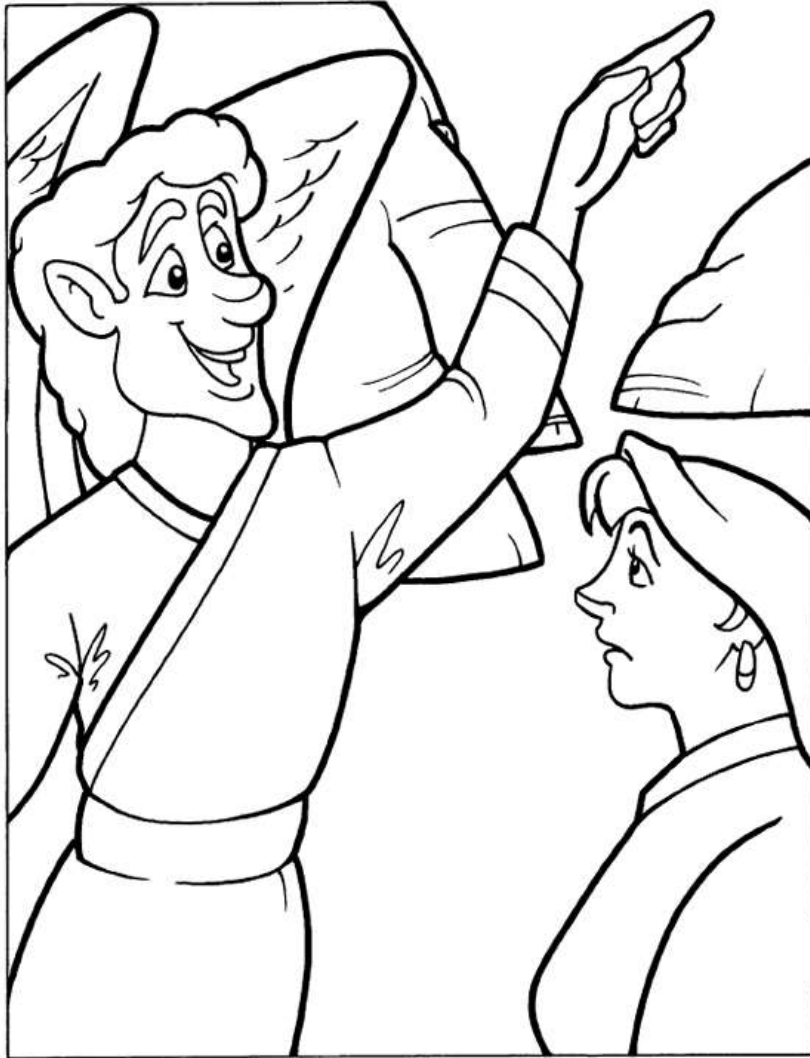
"He is not there, he is risen" Mark 16:6